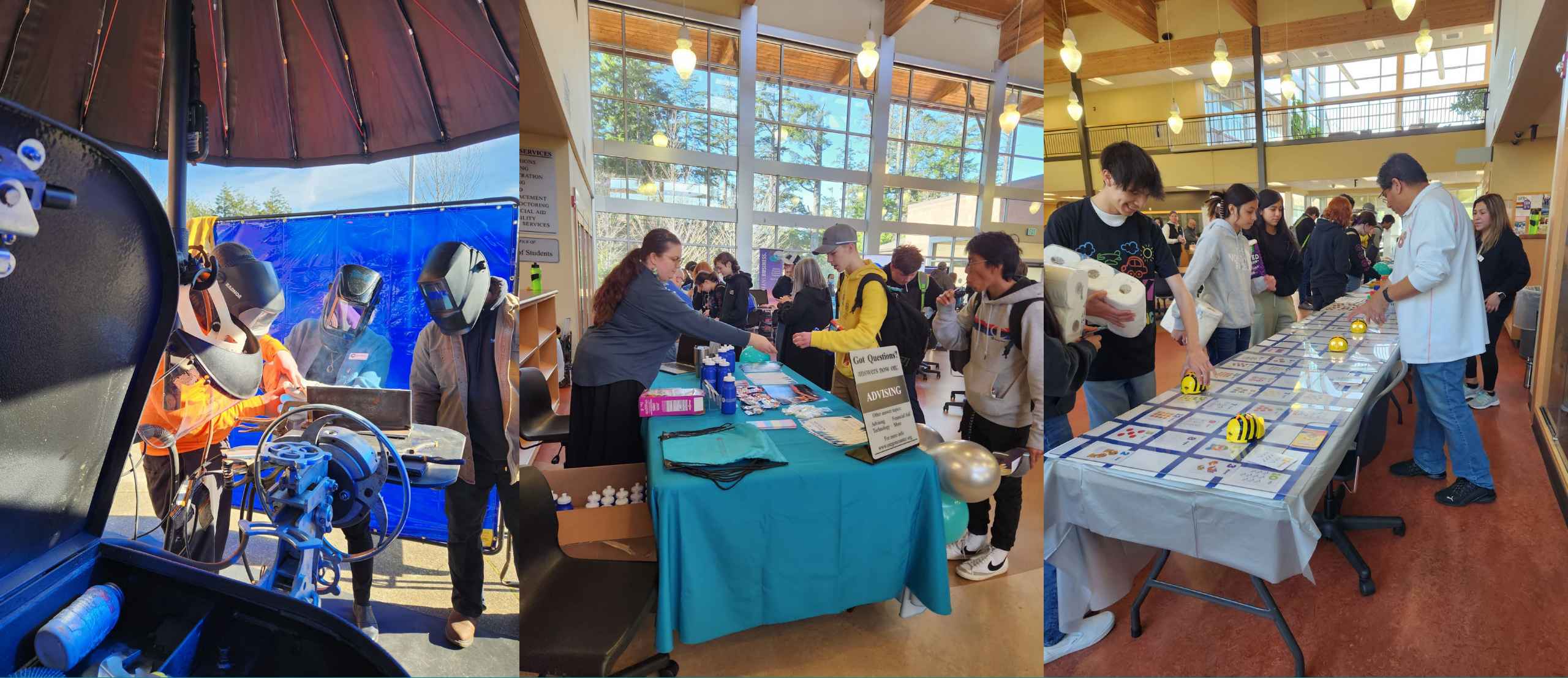
OCCC Programs: ECE, Welding, Business, Computer Science, Math and Nursing